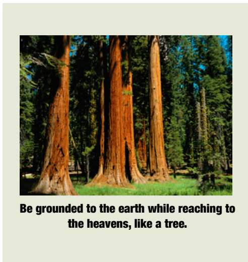
Be grounded to the earth while reaching to the heavens, like a tree.

I don't expect all my clients to have big life-changing dreams to accomplish, but I do look for